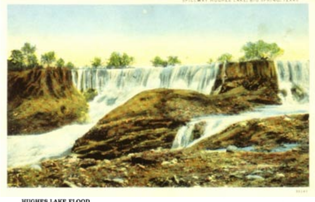
HUGHES LAKE FLOOD

The lake or reservoir created by the Big Spring has had several names. Views below are from the San Angelo highway. Floods would often stop traffic on the highway.