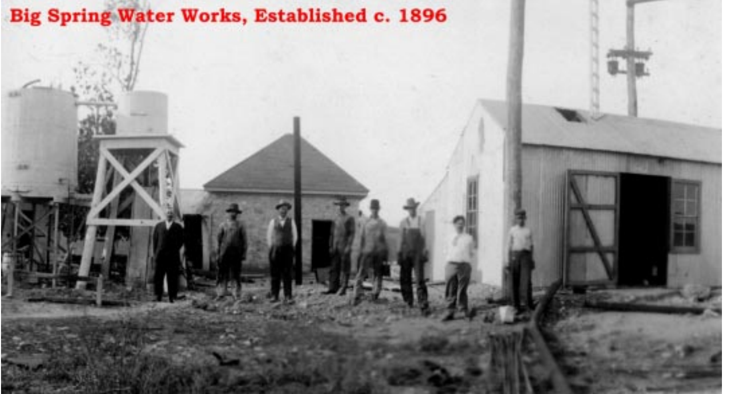
Big Spring Water Works, Established c. 1896

The railroad's need for water and the wells drilled near the big spring reduced the flow to a trickle and then to nada.